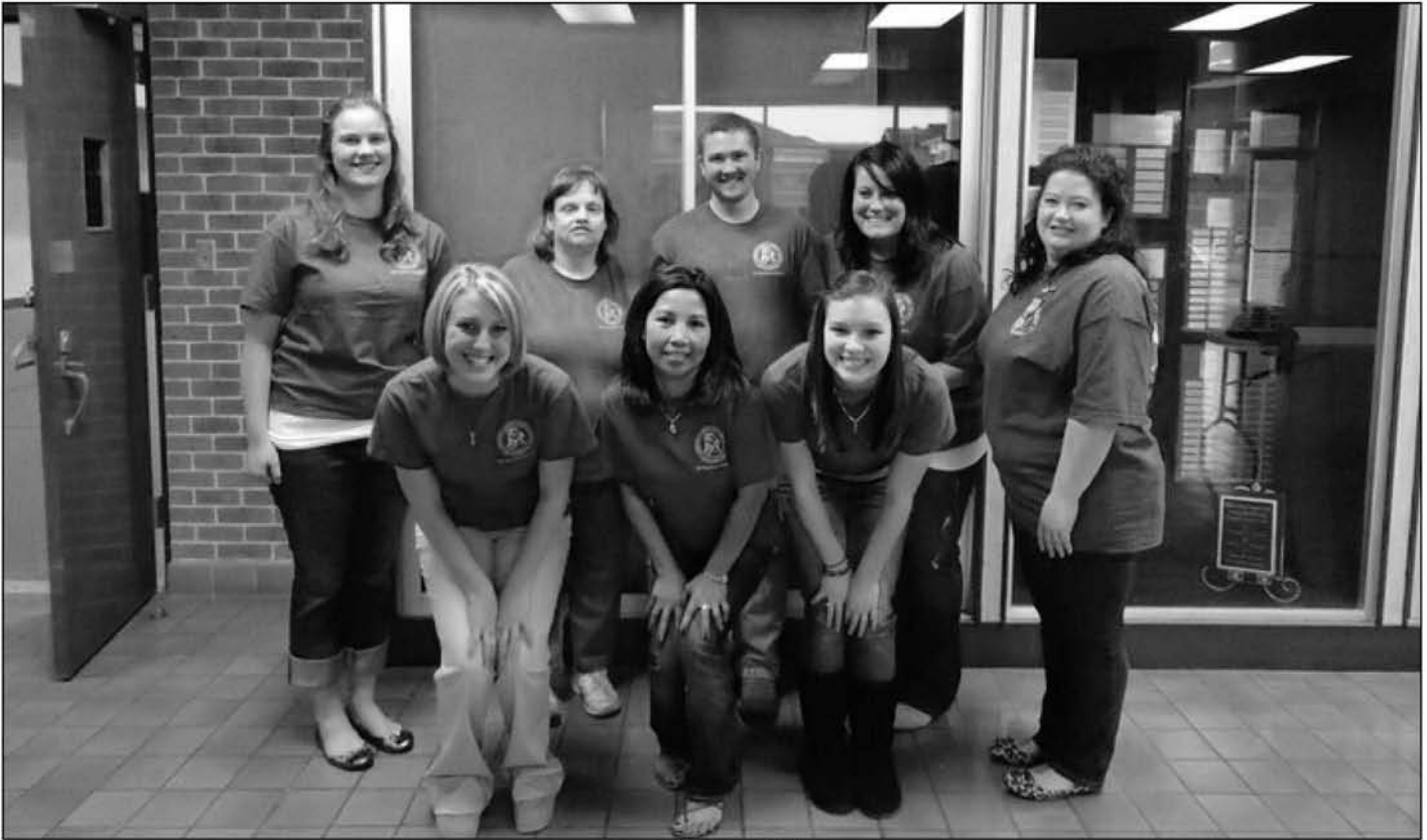
PTK Officers 2011