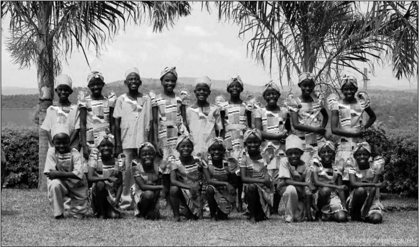
Ugandan Thunder 2011