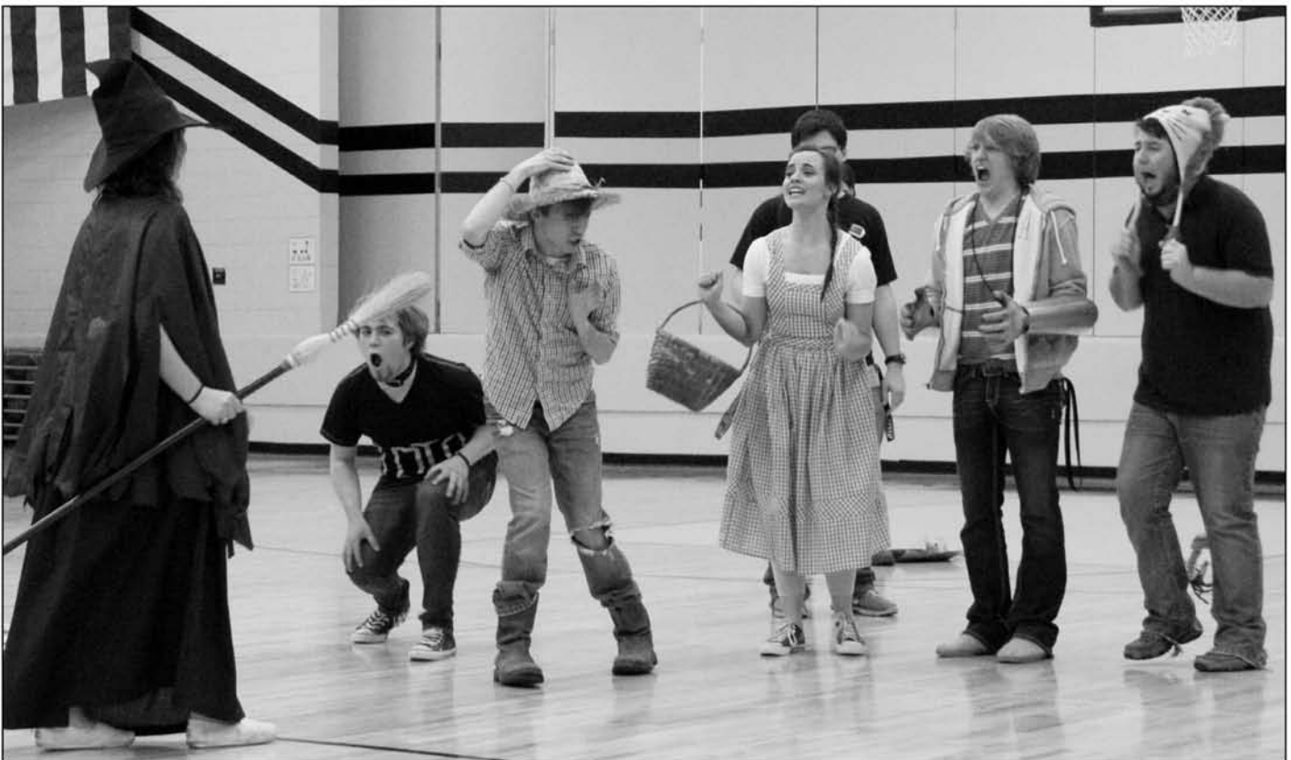
2011 NACC Theatre Outreach Program